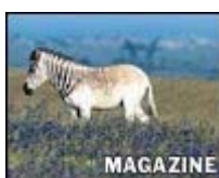
Bringing Back Extinct Animals