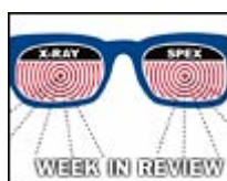
What Are You Lookin' At?