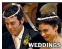
Weddings & Celebrations