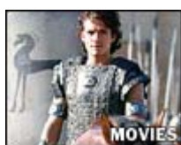
Being the Next Big Thing