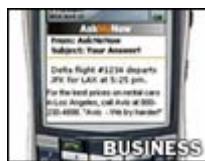
Answers Just a Phone Call Away

Copyright 2005The New York Times Company | Home | Privacy Policy | Search | Corrections | XML | Help | Contact Us | Work f Map | Back to Top